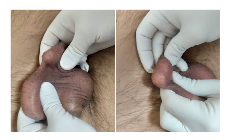
Figure 1. Testis and paratesticuler mass observed on physical examination

Serum tumor markers (beta-human chronic gonadotropin, lactate dehydrogenase, alpha-fetoprotein) were within the normal range. The inguinal exploration was planned due to malignancy risk. We performed inguinal oblique incision and dissection; left testis and scrotal mass was found (Figure 2). We observed that the paratesticular mass was not connected with the testis. The mass, which was adherent to the scrotal skin, was